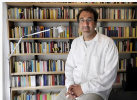
Figure : “I have failed as a scientist and researcher.”